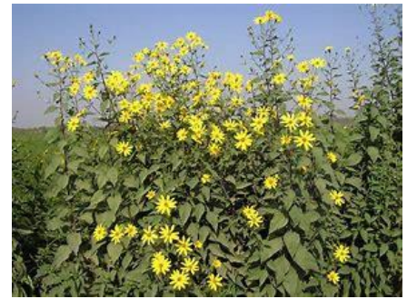
Photo: Jerusalem Artichokes

We welcome everyone to our next event, a Produce Innovation workshop. We have such great growing conditions in the North-West, that we really have an abundance of healthy, great tasting food available. It's fairly well known we can grow avocados in Tasmania, did you know with some patience and a greenhouse you can even grow pineapples and banana's (although its yet to be determined how ripe they get)? Jerusalem Artichokes are one thing that do grow very well in a range of conditions, did you know that not only are they great for diabetics and people wanting an alternative to potatoes, they also form a great windbreak in your garden, and look very attractive as per the photo on the right?