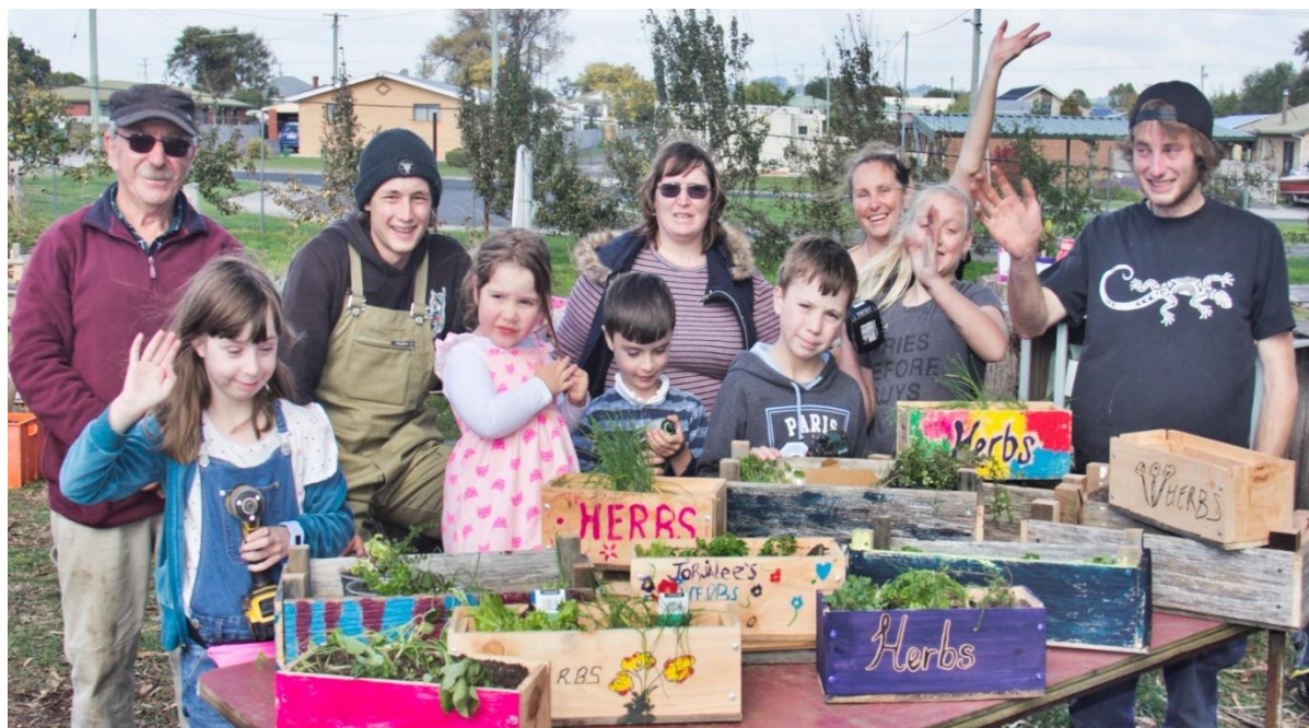
Photo from Herb Box School Holiday Workshop – Wynyard High School and Live Well Tasmania Community Garden