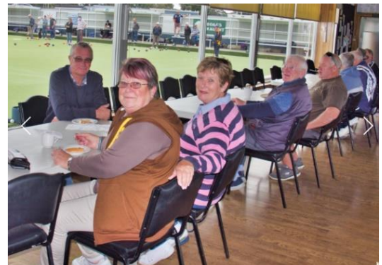
Wynyard Bowls and Community Club participants enjoying some refreshments

Contact the club on 6442 2536, they are located at 15 Park Street in Wynyard.