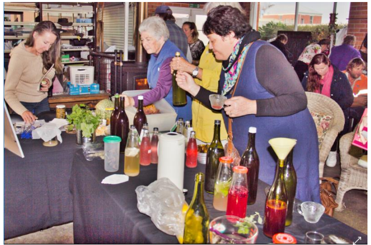
some of the participants enjoying the kefir.