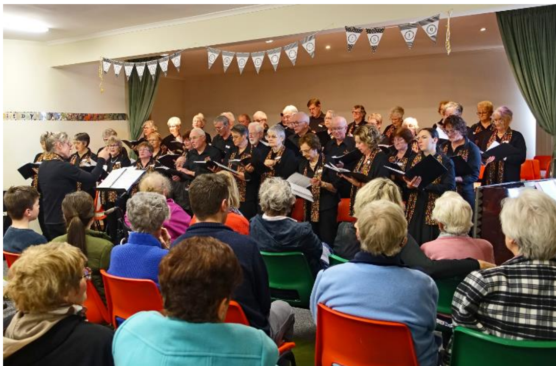
Wynyard Chorale Society – 30 th Year Celebration – Photo Courtesy Sue Darby