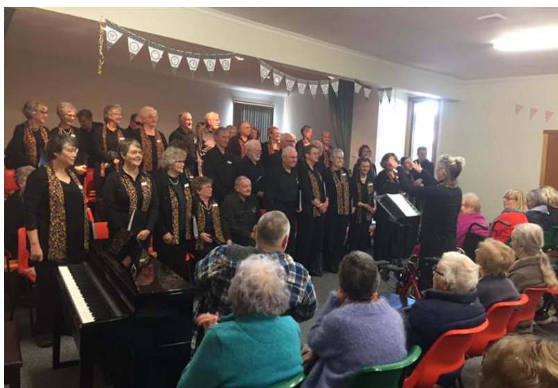
Wynyard Chorale Society – 30 th Year Celebration