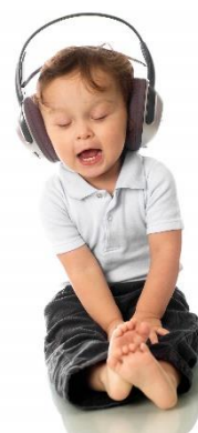
Singing and listening to music releases ‘feel good’ chemicals in our brain